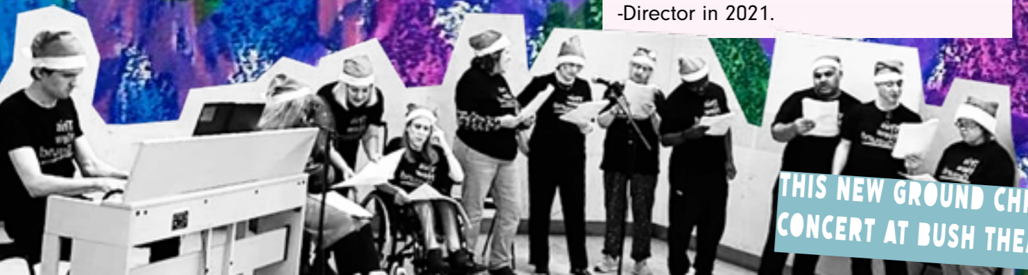
THIS NEW GROUND CHRISTMAS CONCERT AT BUSH THEATRE LONDON

In London we develop projects with our neurodivergent collective, who form our steering group.